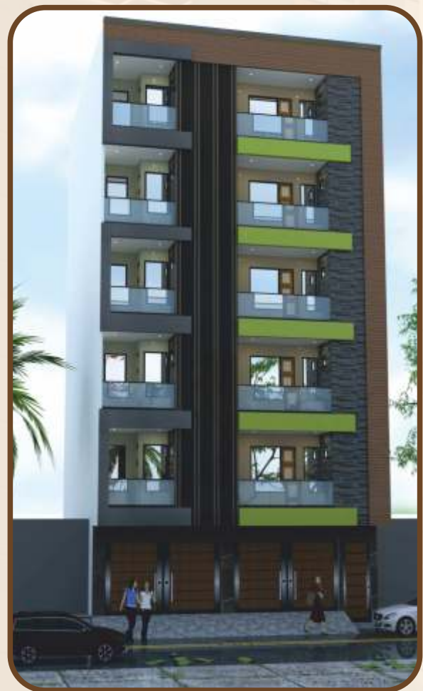
SILVER OAK TOWER-1